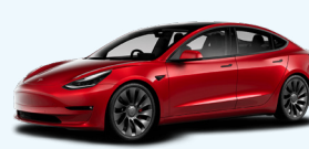
▶ Tesla Model 3