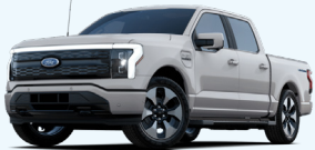
▶ Ford F-150 Lightning