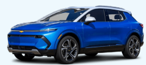
▶ Chevy Equinox EV

▶ There are also used EV models that will save Pennsylvanians money.