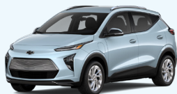
▶ Chevy Bolt EUV