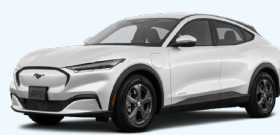
▶ Ford Mustang Mach-E